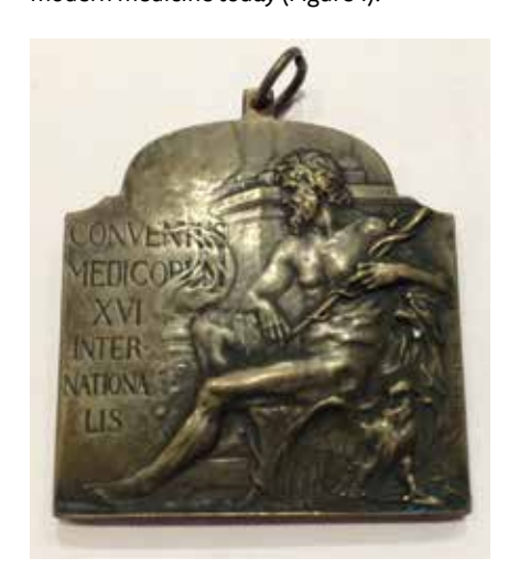
Figure 1: Aesculapius, as depicted on the medal of the 16th International Medical Congress, held in Budapest, 1909.

Aesculapius is a name closely associated with medicine in Greece. It is unclear if a man with that name, who practised healing, ever walked the earth. His name is linked with a 'school' of medicine and religious healing. His symbol, a snake wound around a staff, remains one of the emblems of modern medicine today (Figure 1).